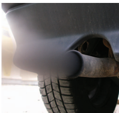
Ná bíodh innill ar siúl agat in áiteanna iata