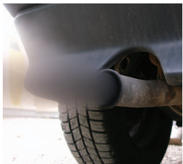
Never run engines in enclosed spaces