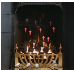
Coimeád simléir saor ó bhac