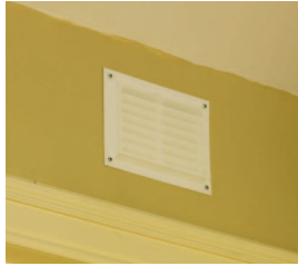
Never block vents