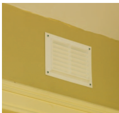
Ná cuir bac ar ghaothairí riamh