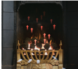
Keep chimneys clear